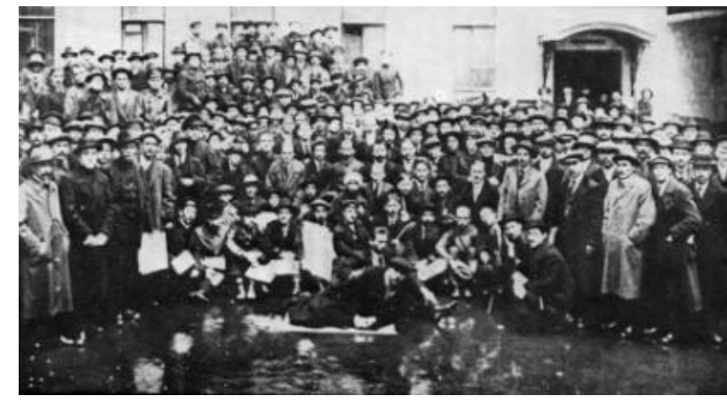
Delegates to the 1st conference of factory committees